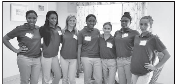
Shelby Crossing Clinicals 2016 - SMTEC