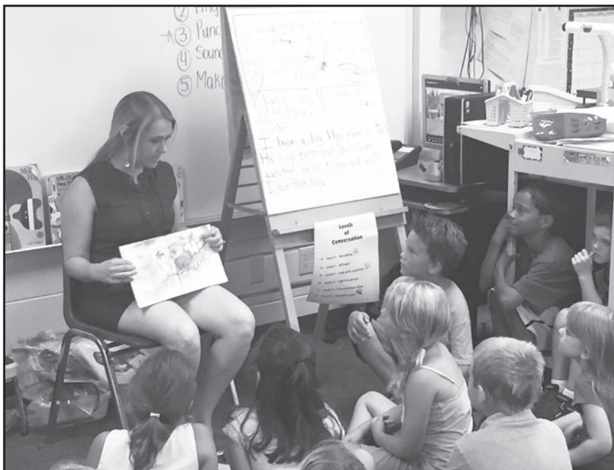
Strengthening literacy skills can take a variety of forms. Students work closely with teachers on whole group and individual proficiencies to take their literacy abilities to the next level.