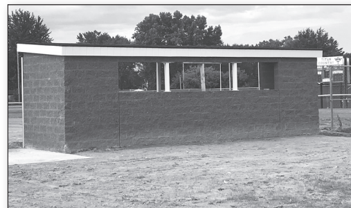
WWT Softball Dugout Painted