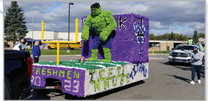
Freshman Float – The Incredible Hulk