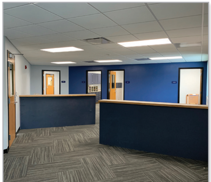
Pinewood Front Office