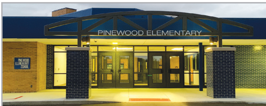
Pinewood Secure Entry