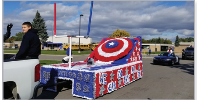
Sophomore Float – Captain America