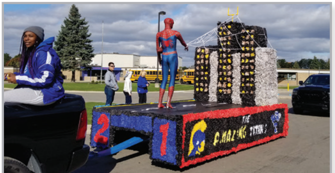
Junior Float – The Amazing Spiderman