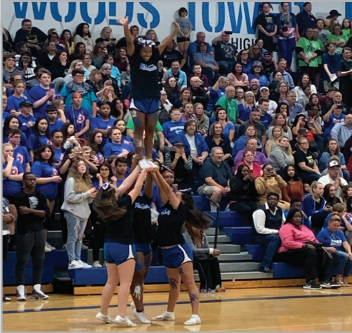
Pep Rally – WWT Cheer Team