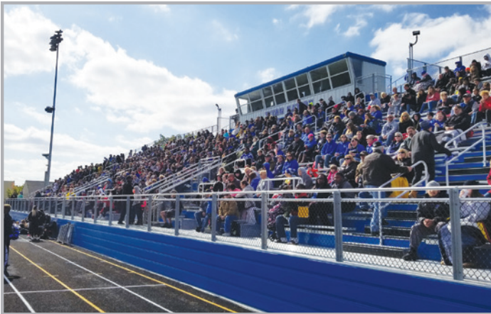
New Grandstand and Press Box at WWT Athletic Complex