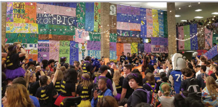
Mini Pep-Rally at WWT