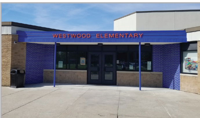
Westwood Elementary New Secure Entrance