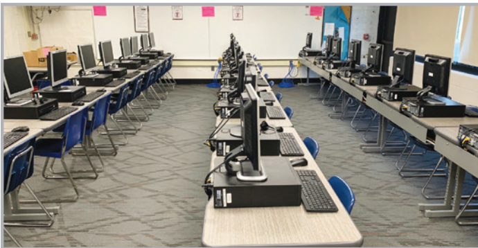
New Classroom Carpet, Computers and Classroom Finishings